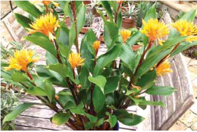
GOLDEN BRUSH GINGER