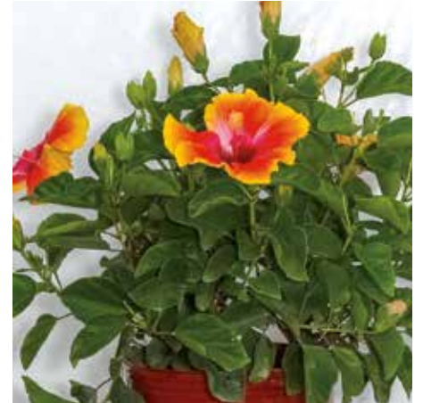
HIBISCUS BUSH FIESTA