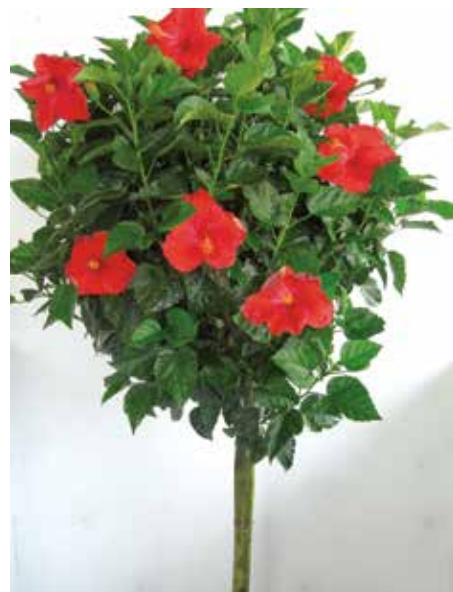
STANDARD HIBISCUS PRESIDENT RED TREE