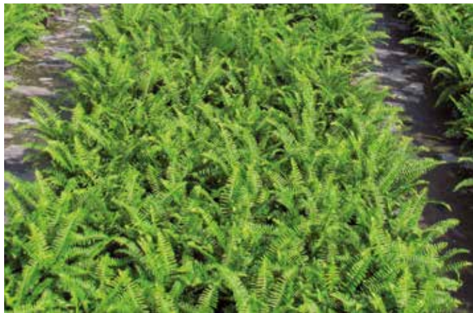
1 GALLON KIMBERLY QUEEN FERN