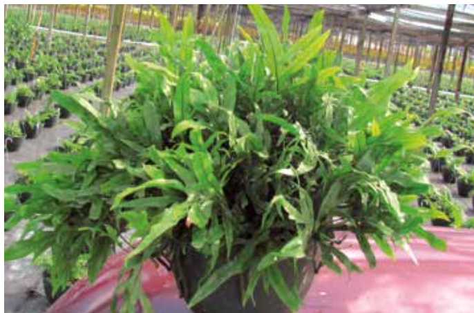
12" HANGING BASKET KANGAROO FERN