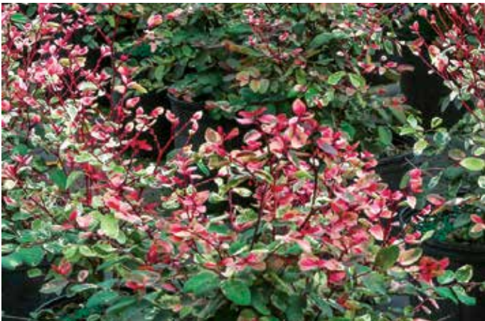
SNOW ON THE MOUNTAIN