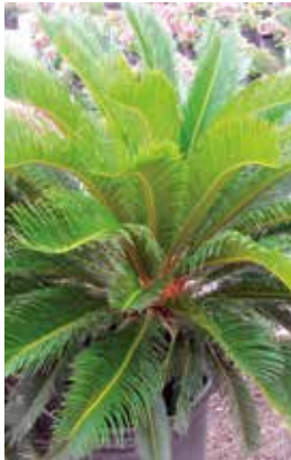
7 GALLON SAGO PALM