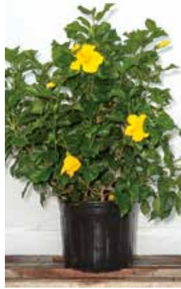
7 GALLON HIBISCUS BUSH FORT MYERS YELLOW