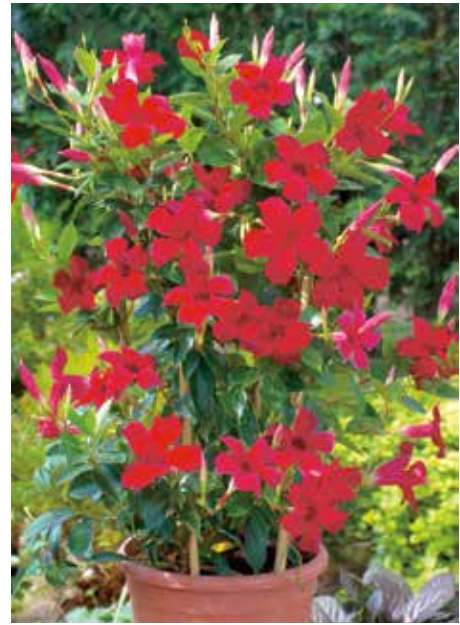
MANDEVILLA PRETTY RED TRELLIS