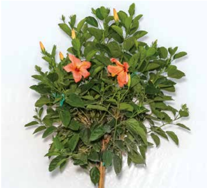
BRAIDED HIBISCUS TREE SINGLE PEACH