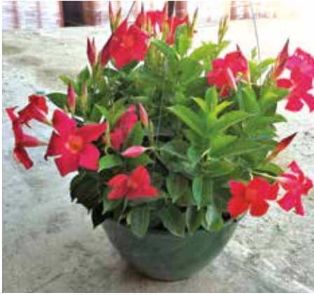
12" HANGING BASKET DIPLADENIA RED