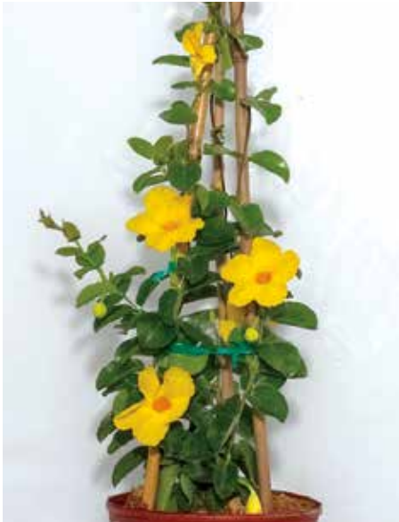
MANDEVILLA YELLOW SUMMER ROMANCE