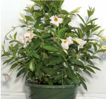
12" HANGING BASKET DIPLADENIA WHITE