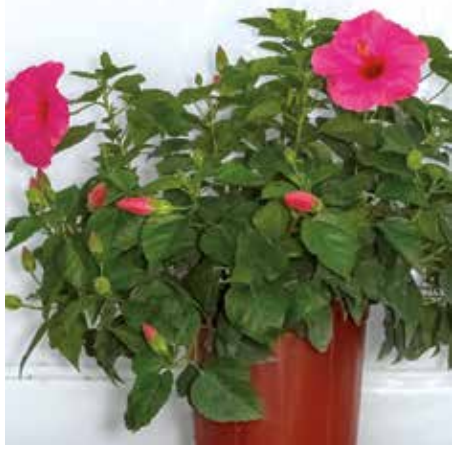
HIBISCUS BUSH YODER PINK