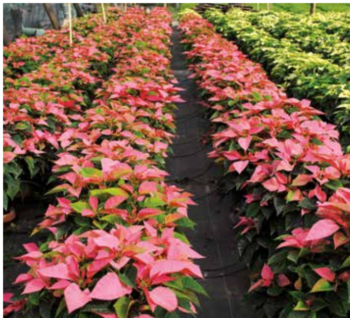
2 GALLON FREEDOM PINK & WHITE