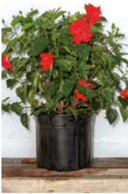
7 GALLON HIBISCUS BUSH DOUBLE RED