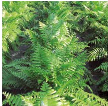
12" HANGING BASKET MACHO FERN