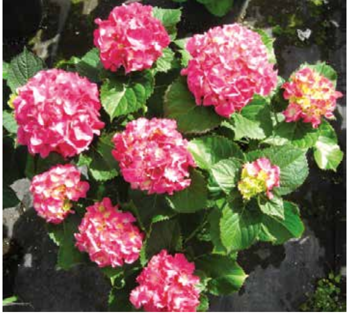
3 GALLON HYDRANGEA BUSH PINK