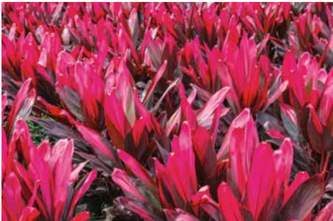
HAWAIIANTI - CORDYLINE FLORIDA