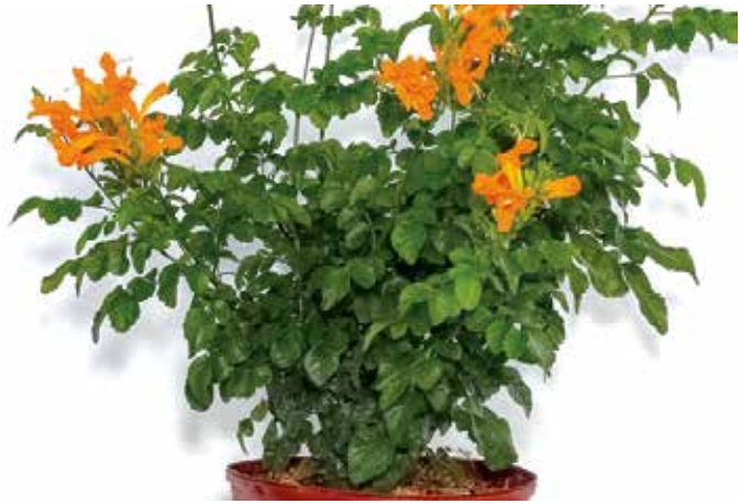
CAPE HONEYSUCKLE BUSH