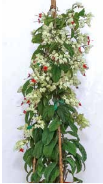
BLEEDING HEART TRELLIS RED & WHITE