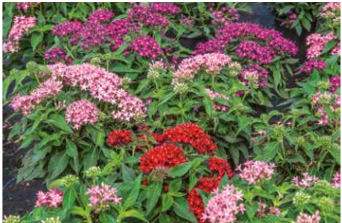
1 GALLON PENTAS