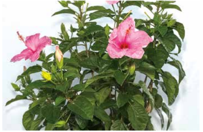
HIBISCUS BUSH SEMINOLE PINK