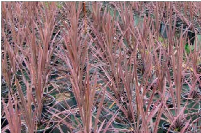
1 GALLON CORDYLINE RED SENSATION