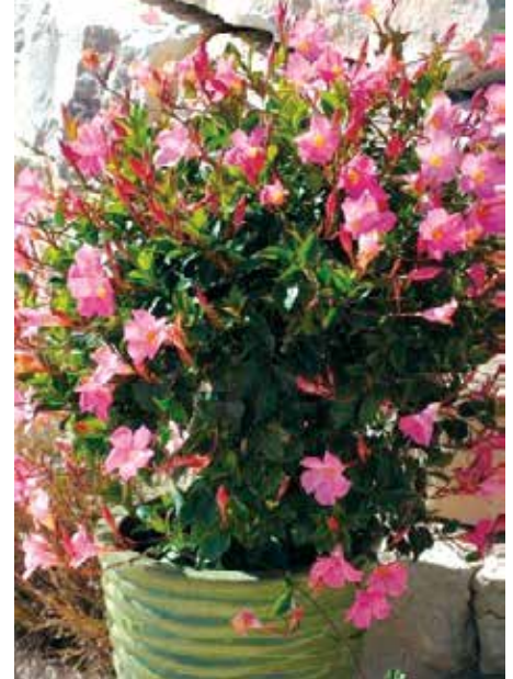
MANDEVILLA PRETTY PINK TRELLIS