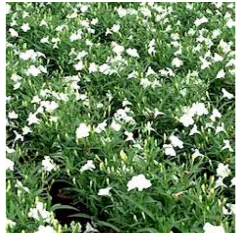
RUELLIA WHITE BUSH