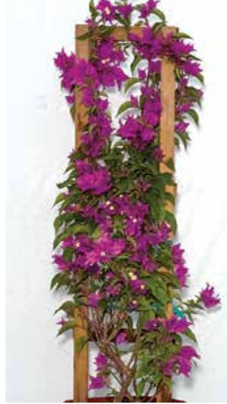
BOUGAINVILLEA TRELLIS PURPLE