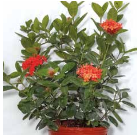
IXORA MAUI RED BUSH