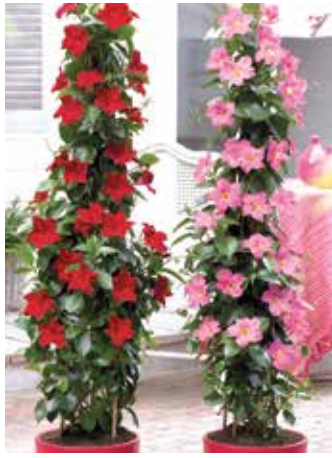
5 GALLON MANDEVILLA