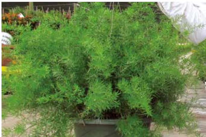
10" HANGING BASKET SPRENGERII FERN