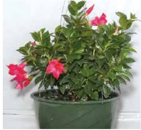
12" HANGING BASKET DIPLADENIA PINK