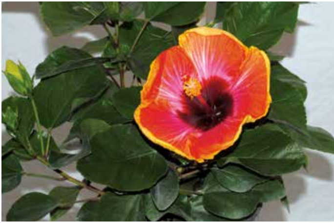
1 GALLON HIBISCUS BUSH FIESTA