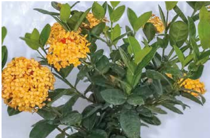
IXORA MAUI YELLOW BUSH