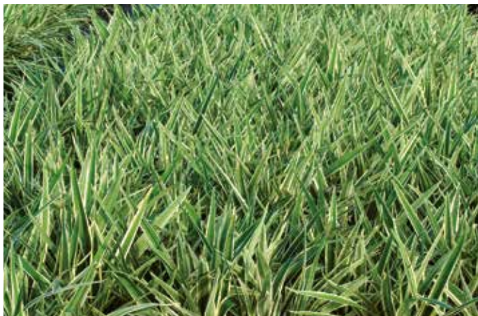
1 GALLON DIANELLA FLAX LILLY