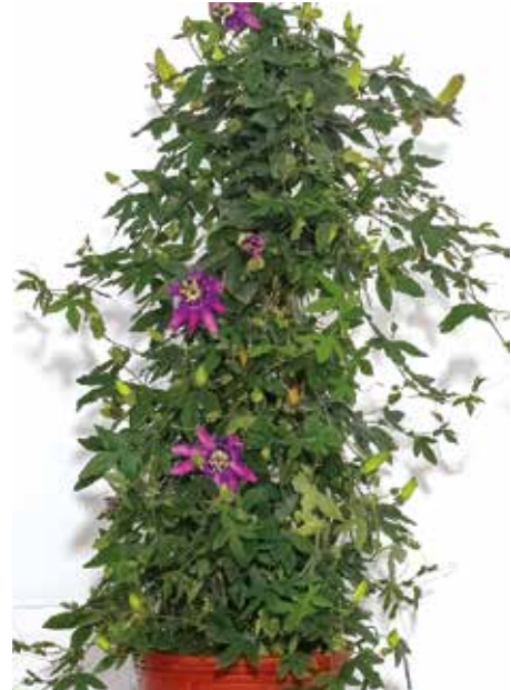
PURPLE PASSION VINE TRELLIS