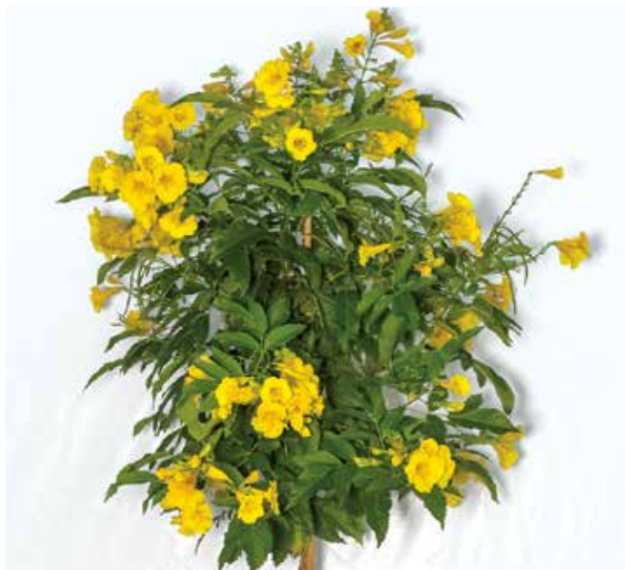
STANDARD ESPERANZA TREE