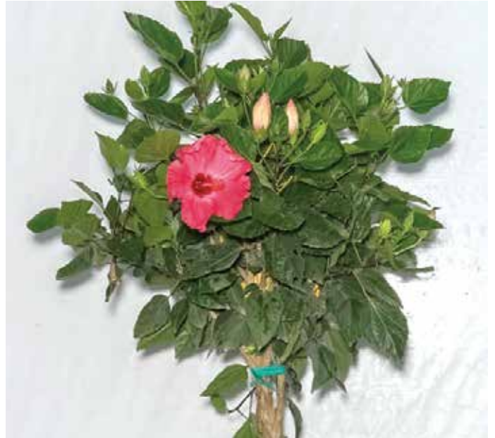
BRAIDED HIBISCUS TREE PAINTED LADY