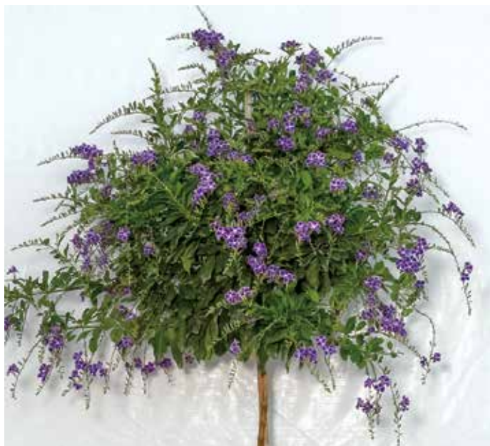
STANDARD DURANTA SAPHIRE SHOWERS TREE