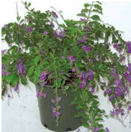
DURANTE SAPHIRE SHOWERS BUSH