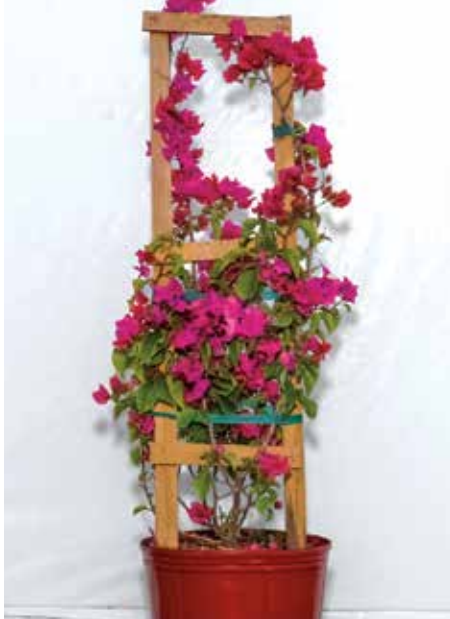
BOUGAINVILLEA TRELLIS PINK