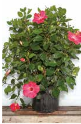
7 GALLON HIBISCUS BUSH PAINTED LADY PINK