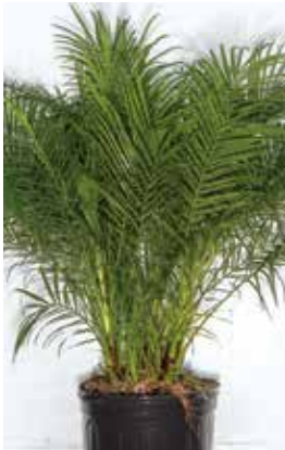
7 GALLON ROEBELLENII PALM