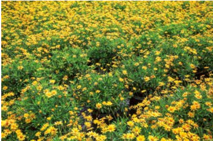
CALIFORNIA BUSH DAISY