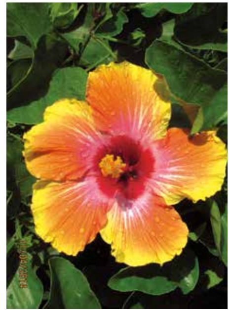
STANDARD HIBISCUS TREE FIESTA