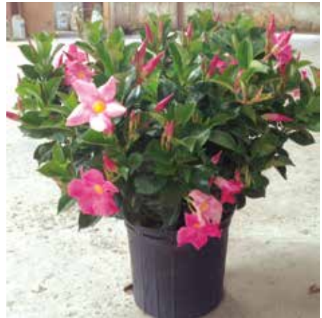
DIPLADENIA BUSH PINK