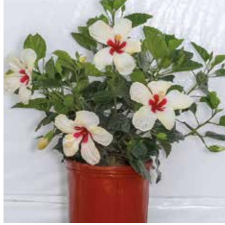
HIBISCUS BUSH YODER WHITE WING