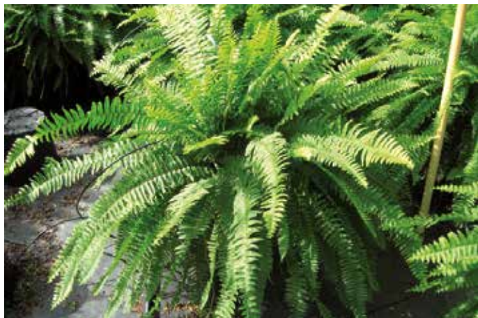
10" HANGING BASKET BOSTON FERN