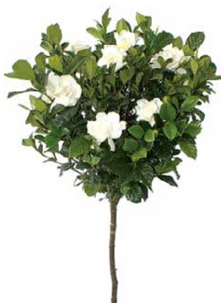
STANDARD GARDENIA AIMEE TREE