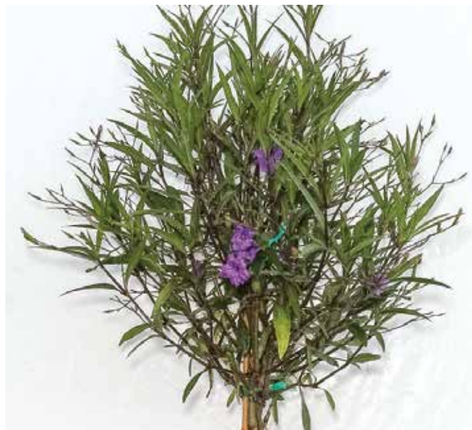
BRAIDED RUELLIA PURPLE SHOWERS TREE