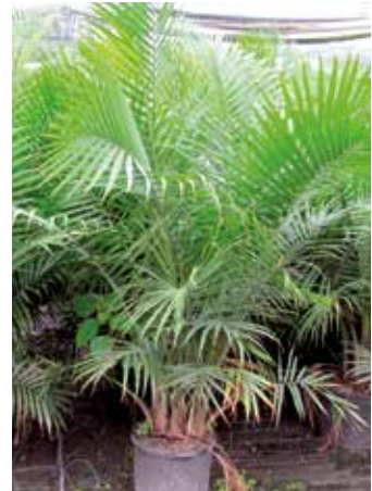
7 GALLON MAJESTY PALM