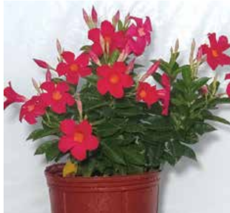
DIPLADENIA BUSH CORAL (SUNDENIA)