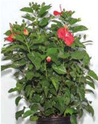
7 GALLON HIBISCUS BUSH PRESIDENT RED