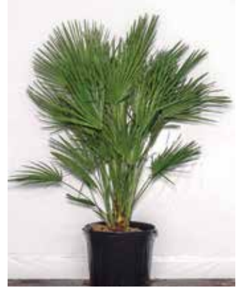
7 GALLON EUROPEAN FAN PALM