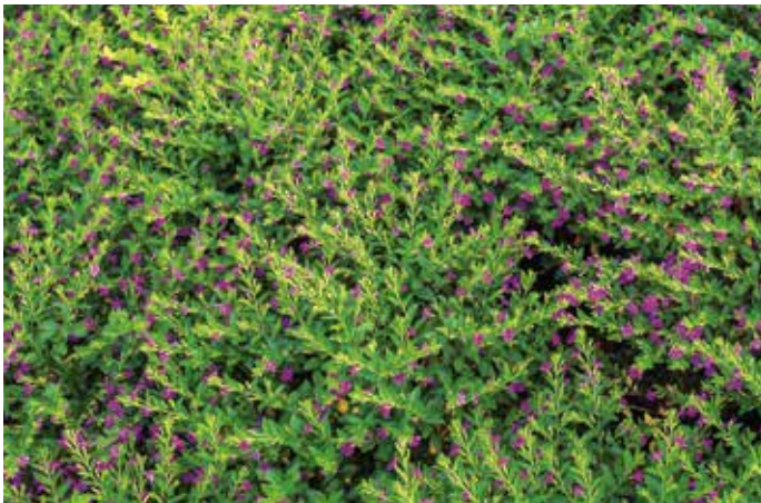
1 GALLON MEXICAN HEATHER