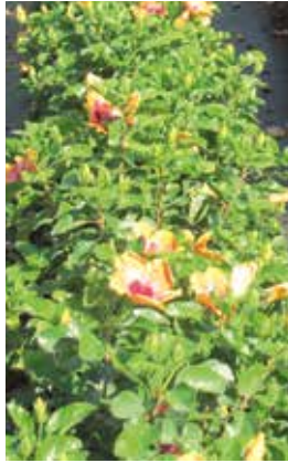
7 GALLON HIBISCUS BUSH FIESTA