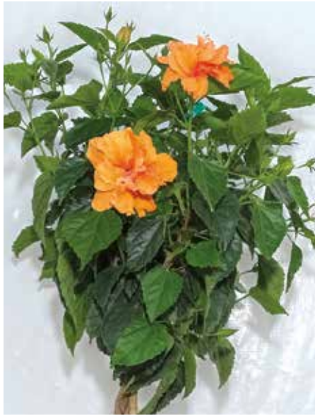
STANDARD HIBISCUS TREE DOUBLE PEACH