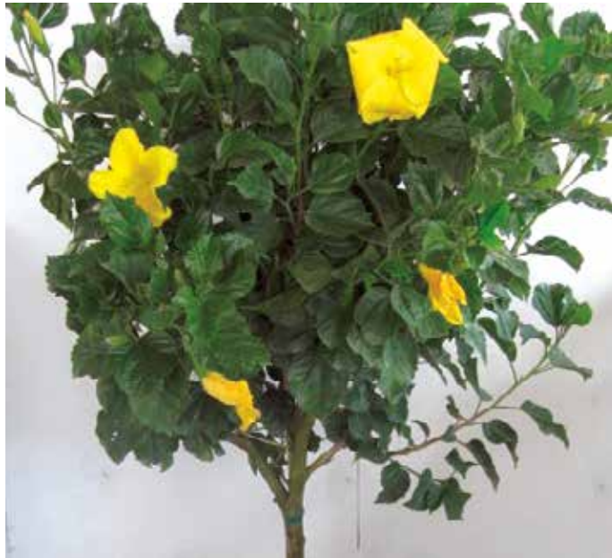
STANDARD HIBISCUS TREE FORT MYERS YELLOW