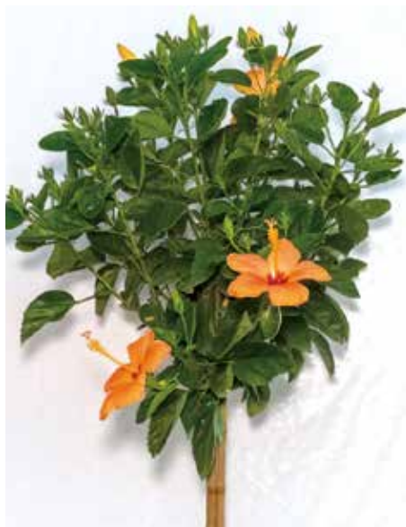
STANDARD HIBISCUS TREE SINGLE PEACH