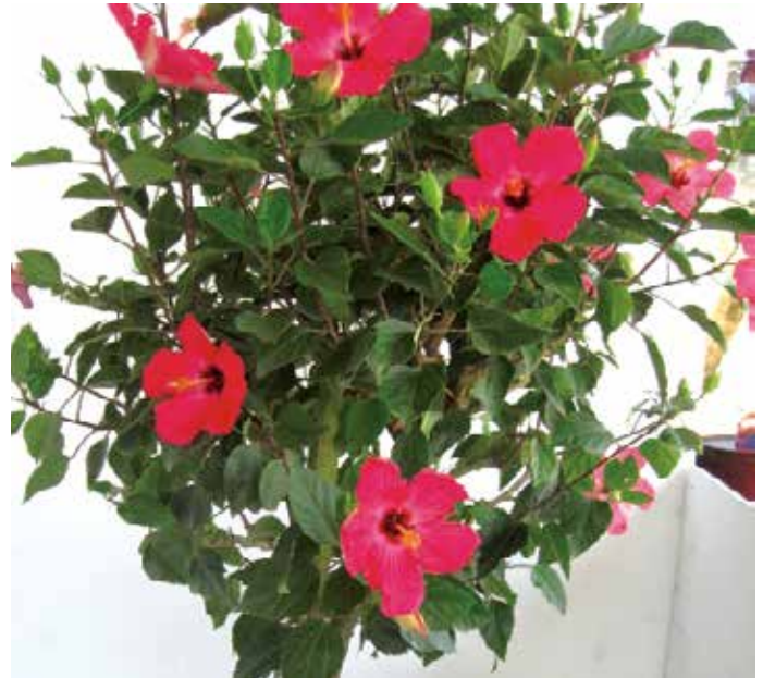
STANDARD HIBISCUS TREE PAINTED LADY