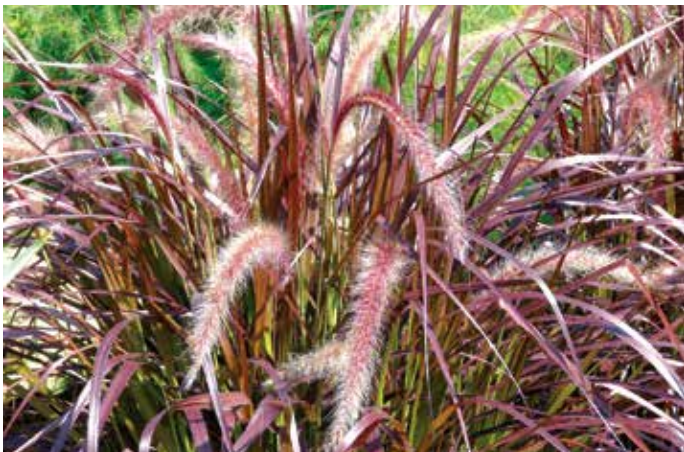
RED FOUNTAIN GRASS