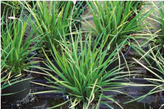
1 GALLON SOCIETY GARLIC