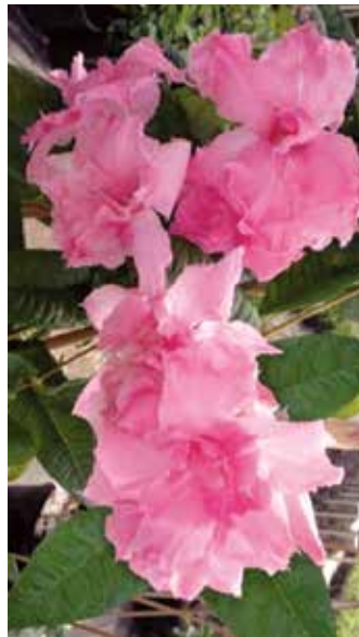
MANDEVILLA DOUBLE PINK TRELLIS