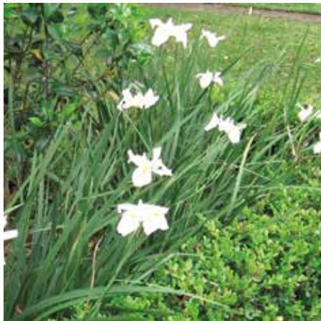
IRIS WHITE AFRICAN BUTTERFLY IRIS