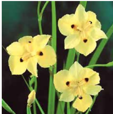
IRIS YELLOW AFRICAN IRIS