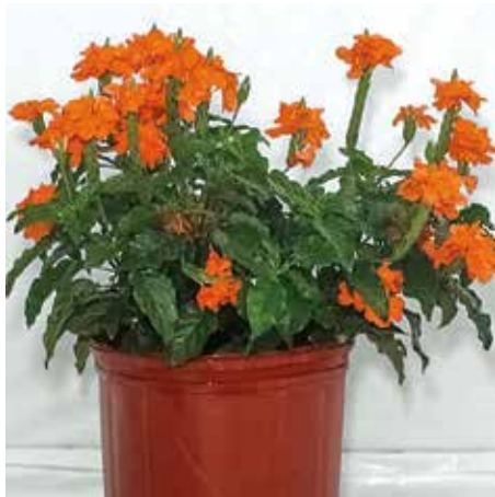
CROSSANDRA ORANGE MARMALADE