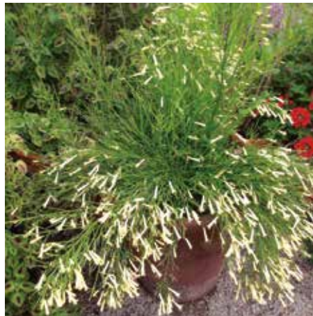
FIRE CRACKER BUSH YELLOW