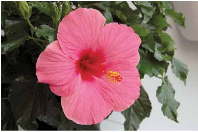
YODER HIBISCUS CAYMAN WIND