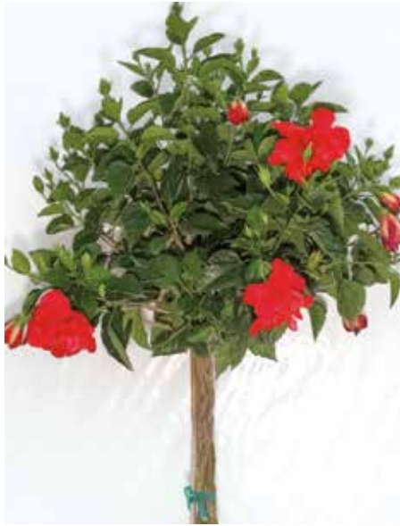
BRAIDED HIBISCUS TREE DOUBLE RED