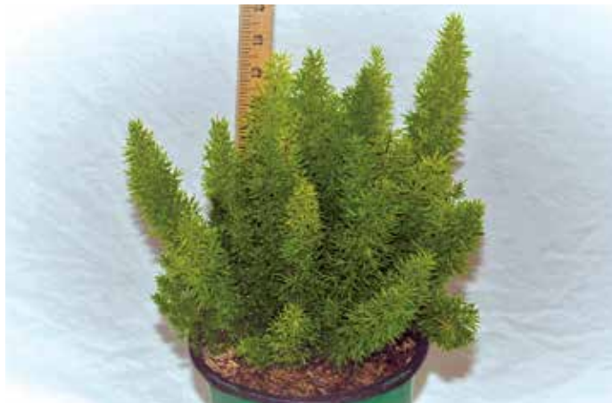
1 GALLON FOXTAIL FERN