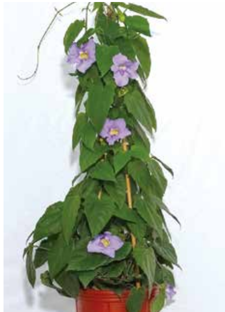
THUNBERGIA SKY VINE TRELLI