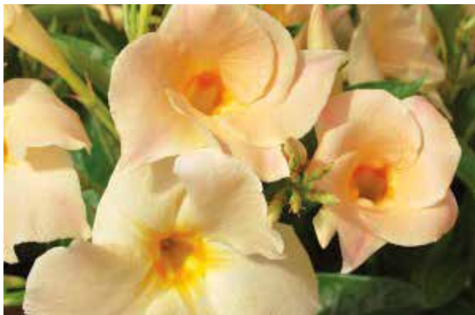
12" HANGING BASKETS MANDEVILLA APRICOT