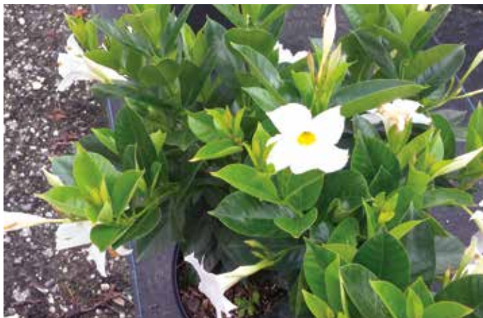
1 GALLON DIPLADENIA WHITE