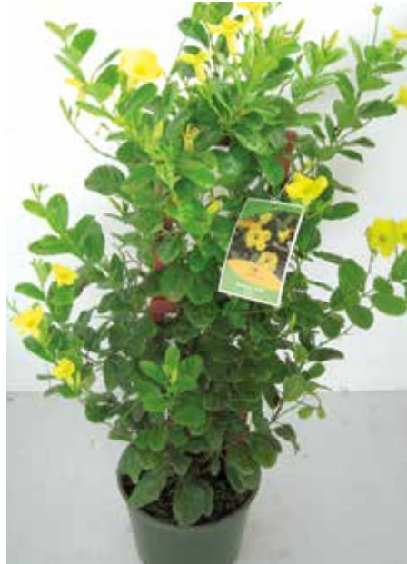
MANDEVILLA YELLOW TRELLIS