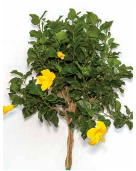
BRAIDED HIBISCUS TREE FORT MYERS YELLOW