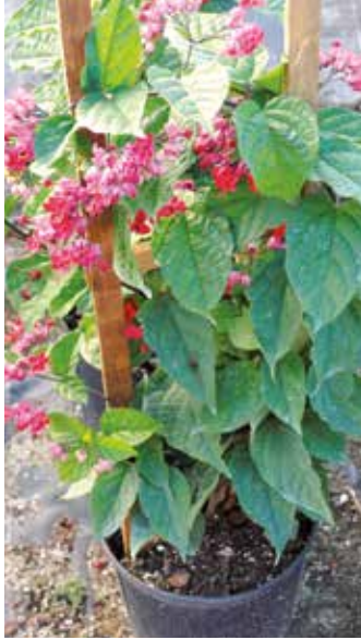
BLEEDING HEART TRELLIS PURPLE & RED