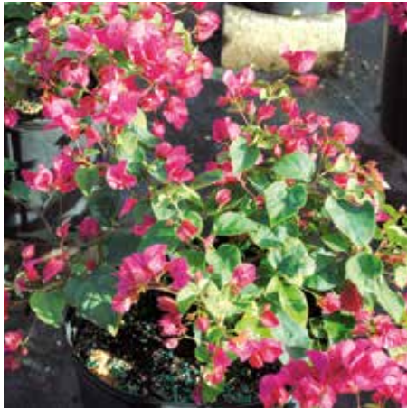
BOUGAINVILLEA BUSH RED