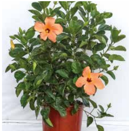
HIBISCUS BUSH SINGLE PEACH