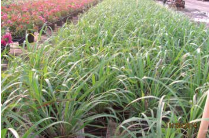
1 GALLON LEMON GRASS