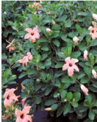
7 GALLON HIBISCUS SINGLE PEACH