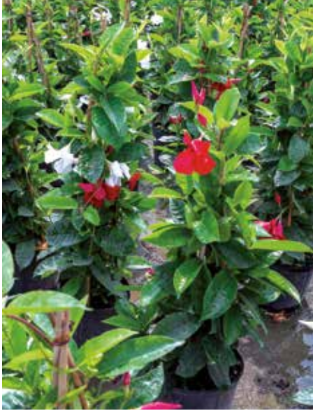
MANDEVILLA MIXED GIANT RED AND WHITE MIXED TRELLIS