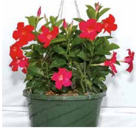
12" HANGING BASKET DIPLADENIA CORAL