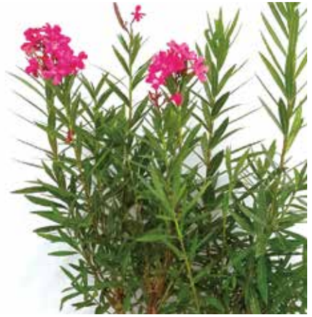
OLEANDER BUSH CALYPSO PINK