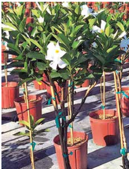
STANDARD MANDEVILLA DESIGNER WHITE TREE