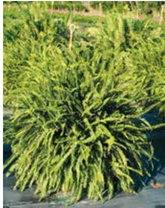
7 GALLON KIMBERLY QUEEN FERN