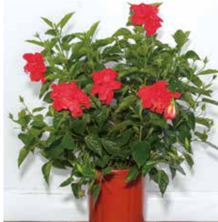
HIBISCUS BUSH DOUBLE RED