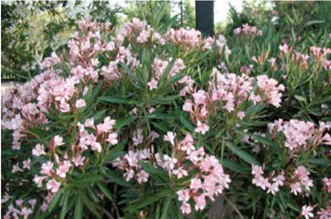
OLEANDER PETITE PINK