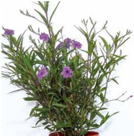
RUELLIA PURPLE SHOWERS BUSH