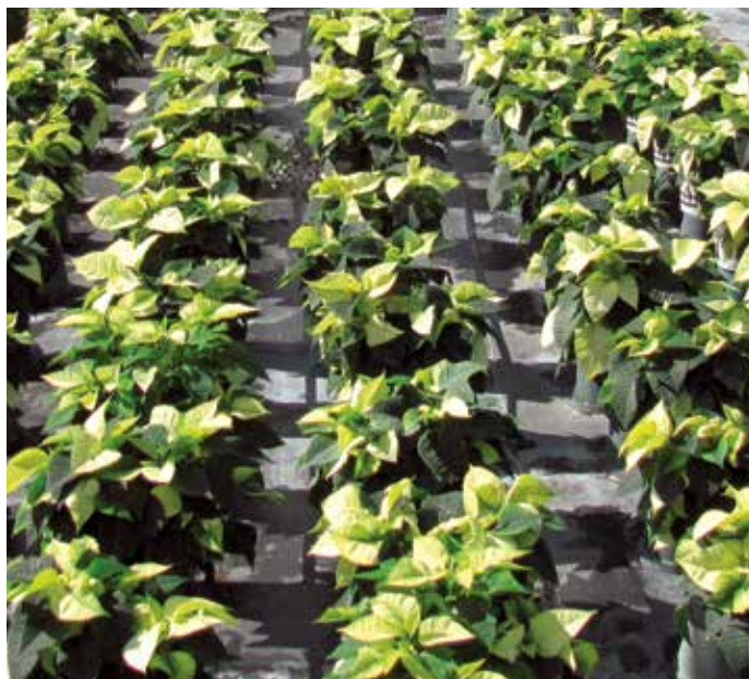
1 GALLON FREEDOM WHITE POINSETTIAS