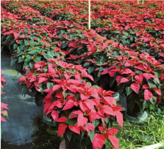
3 GALLON POINSETTIAS