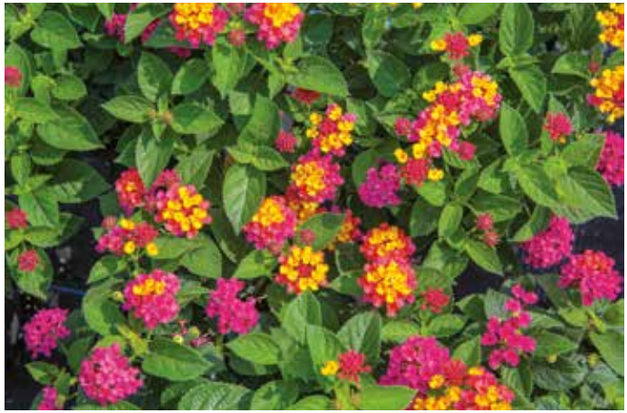
1 GALLON LANTANA