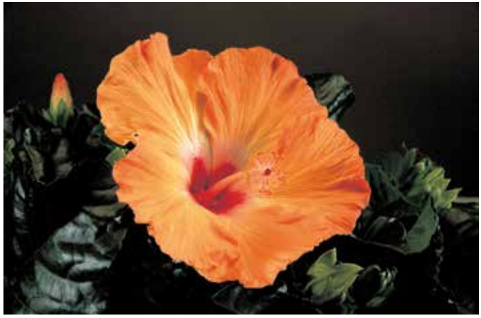
YODER HIBISCUS MANDARIN WIND