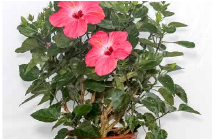
HIBISCUS BUSH PAINTED LADY PINK