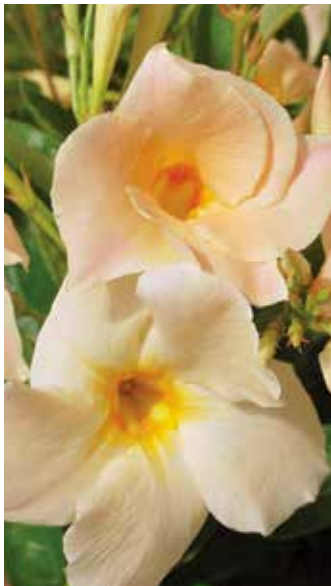
MANDEVILLA APRICOTT TRELLIS