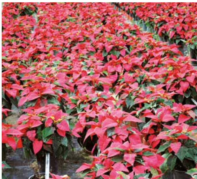
1 GALLON FREEDOM RED