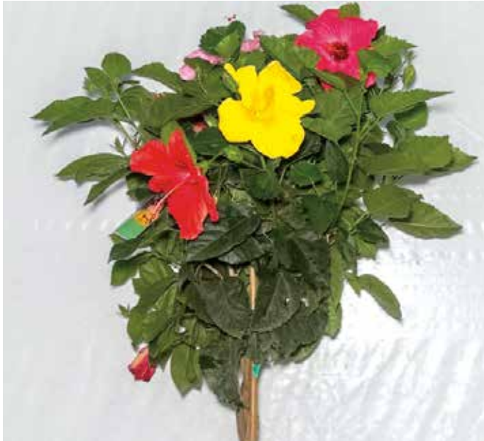
BRAIDED HIBISCUS TREE MIXED COLORS