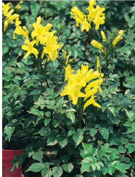
CAPE HONEYSUCKLE YELLOW TRELLIS