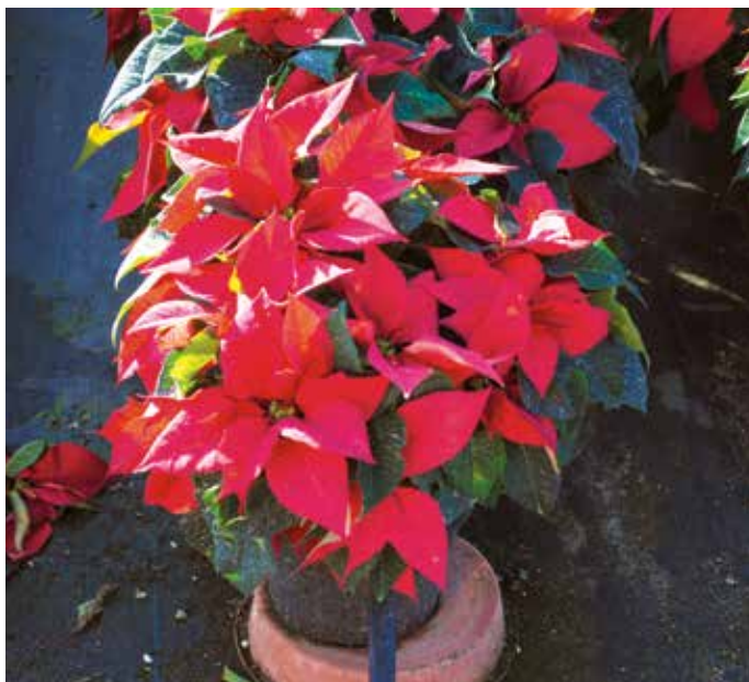
1 GALLON FREEDOM RED POINSETTIA