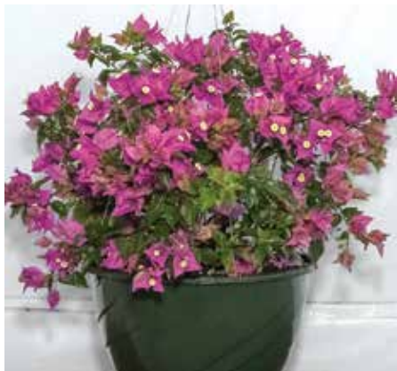
12" HANGING BASKET BOUGAINVILLEA PURPLE