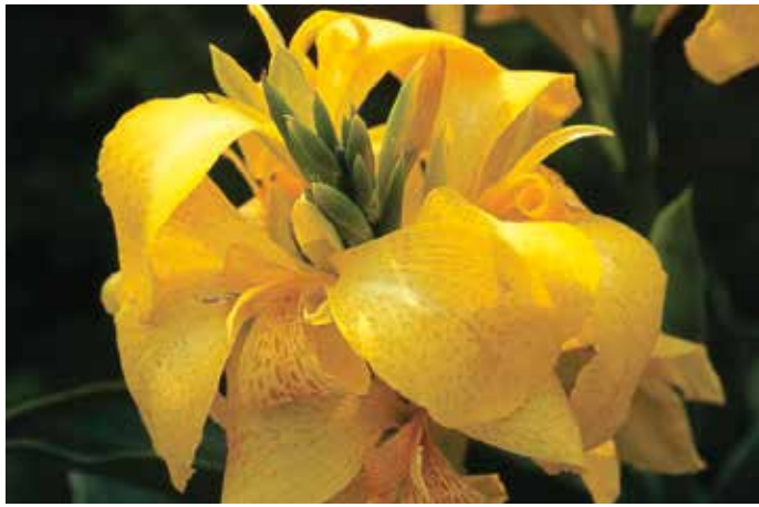
CANNA LILLY YELLOW