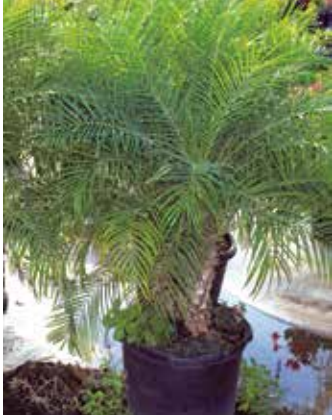
15 GALLON ROEBELLENII PALM