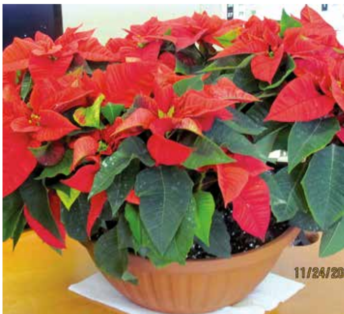
14" POINSETTIA BOWL