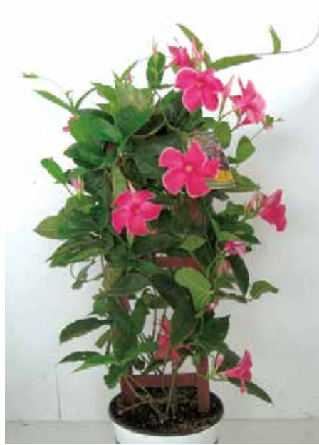
MANDEVILLA PINK TRELLIS