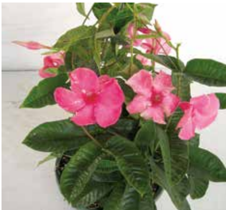
12" MANDEVILLA PINK HANGING BASKETS