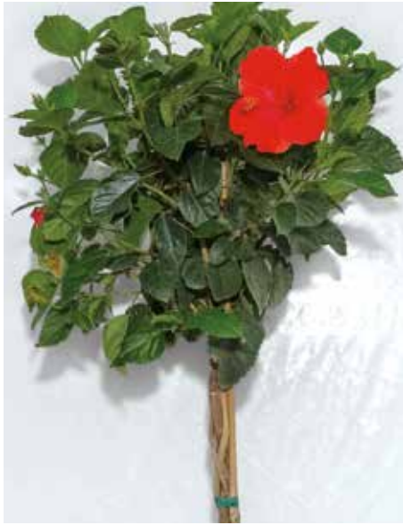
BRAIDED HIBISCUS TREE PRESIDENT RED