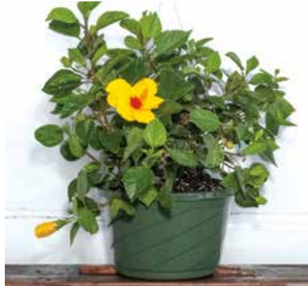
12" HANGING BASKET HIBISCUS DWARF YELLOW