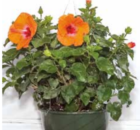
12" HANGING BASKET DWARF HIBISCUS ORANGE