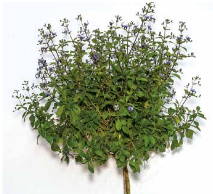
STANDARD BLUE BUTTERFLY TREE