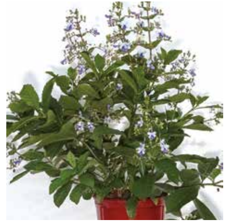
BLUE BUTTERFLY BUSH