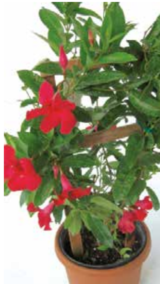
MANDEVILLA GIANT RED TRELLIS