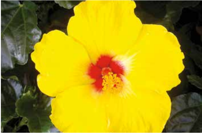
YODER HIBISCUS SUNNY WIND