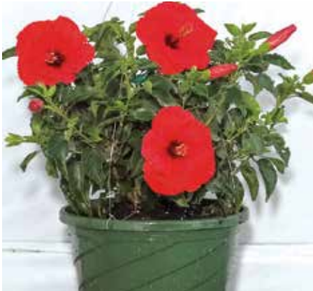
12" HANGING BASKET HIBISCUS DWARF RED