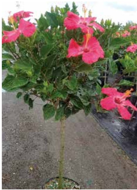
STANDARD HIBISCUS PAINTED LADY