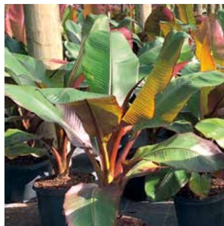
BANANA ENSETE MAURELLII