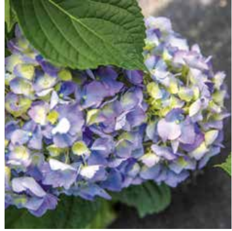
HYDRANGEA BUSH BLUE