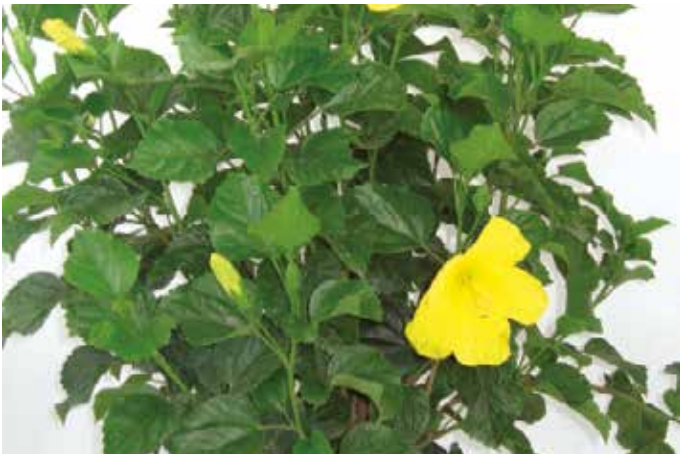
HIBISCUS BUSH FT MYERS YELLOW