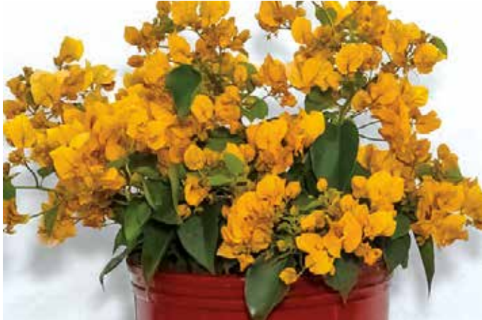
BOUGAINVILLEA BUSH GOLD