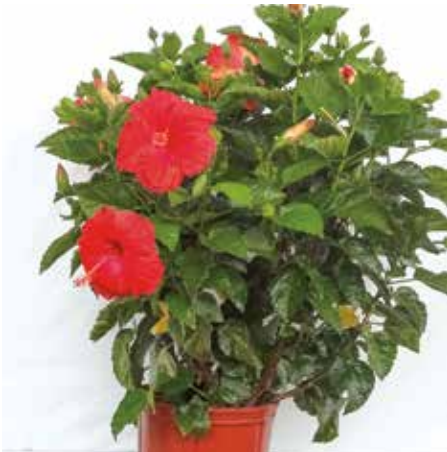
HIBISCUS BUSH PRESIDENT RED