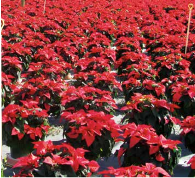
2 GALLON POINSETTIA