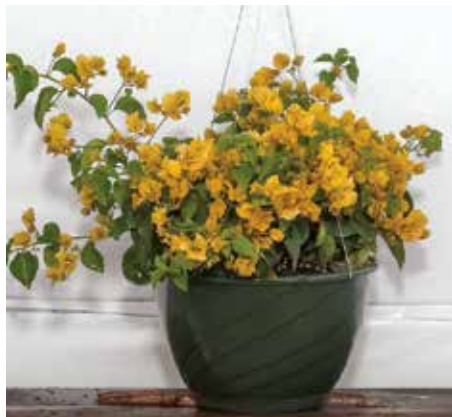
12" HANGING BASKET BOUGAINVILLEA GOLD