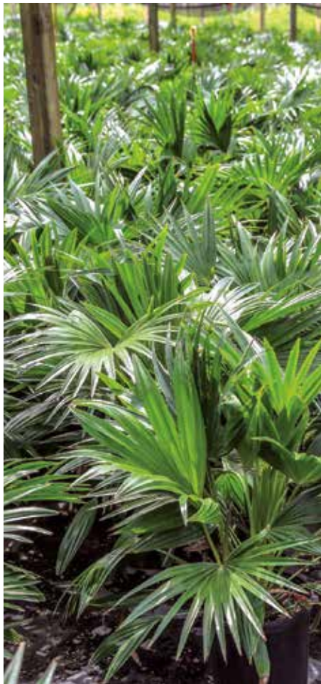
CHINESE FAN PALM