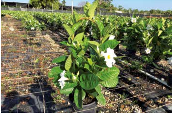
1 GALLON MANDEVILLA WHITE TRELLIS)