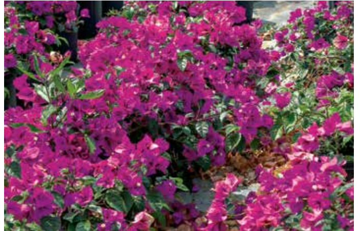
BOUGAINVILLEA BUSH PURPLE