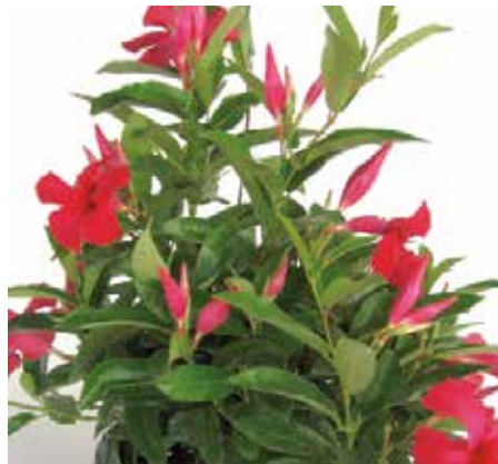
12" MANDEVILLA RED GIANT HANGING BASKETS