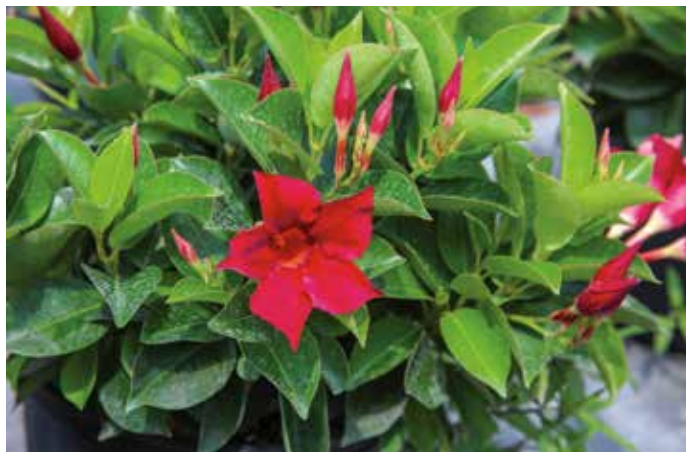
1 GALLON DIPLADENIA BUSH RED