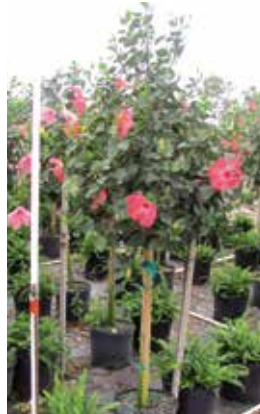
7 GALLON STANDARD HIBISCUS