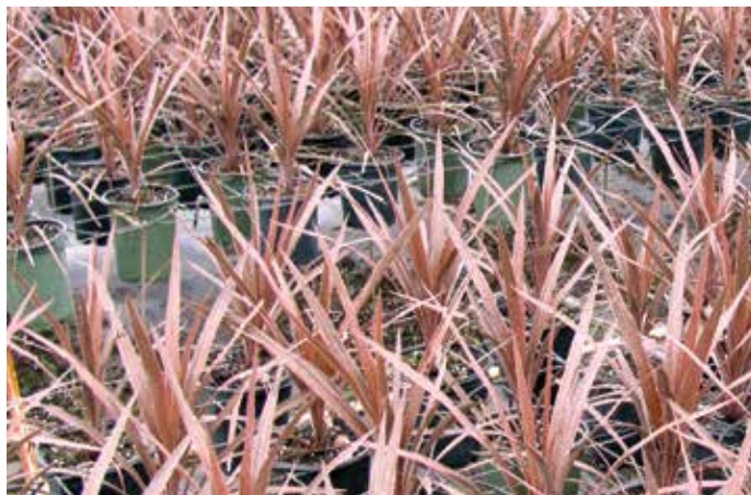
1 GALLON CORDYLINE RED STAR