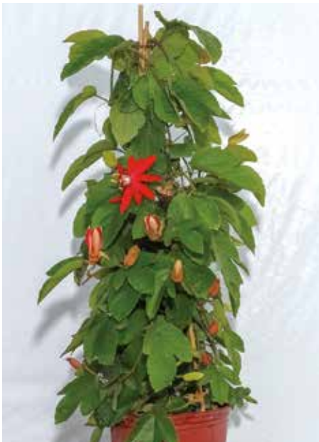
RED PASSION VINE TRELLIS