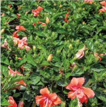
HIBISCUS BUSH DOUBLE PEACH