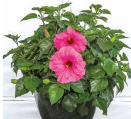
12" HANGING BASKET DWARF HIBISCUS PINK