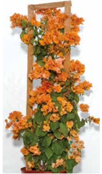
BOUGAINVILLEA TRELLIS GOLD