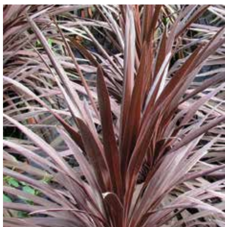
CORDYLINE RED SENSATION