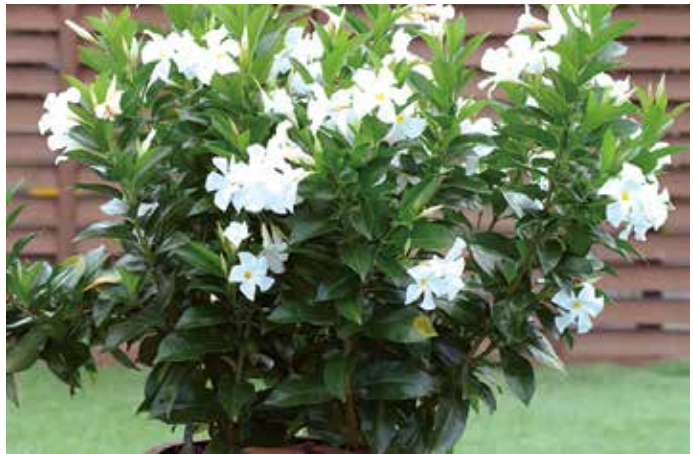
DIPLADENIA BUSH SUNDENIA WHITE