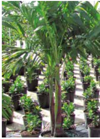
7 GALLON ADONIDIA PALM