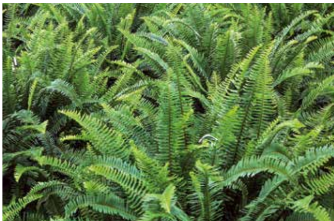
12" HANGING BASKET KIMBERLY QUEEN FERN