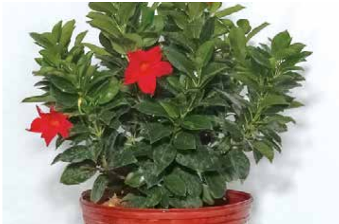
DIPLADENIA BUSH RED